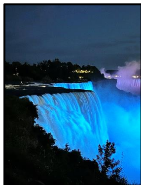
Niagara Falls at Night