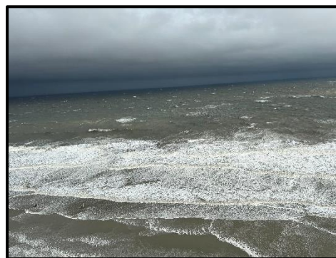
Hurricane Ian Passes By

November 15. Their work will stay up in the Gallery for six months, after which it will be archived for two years.