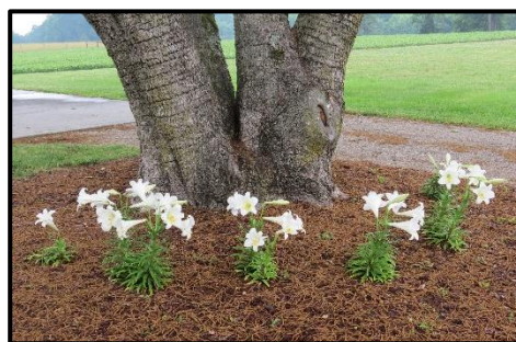
Easter in June

The new Fall 2023 Gallery will be available for viewing online on